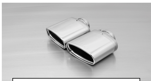
#14SS: tail pipe 142x72 mm angled/angled, chromed