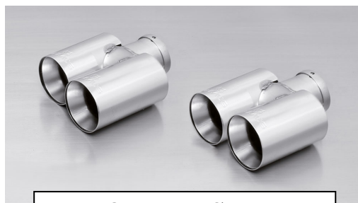
#04G: tail pipe Ø 76 mm, straight cut, chromed