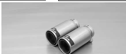
#98C: tail pipes Ø 98 mm Street Race, polished