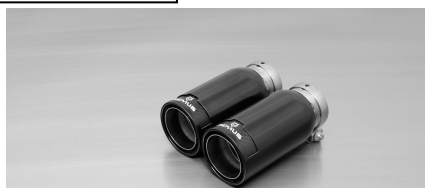
#98CB: tail pipes Ø 98 mm Street Race Black Chrome