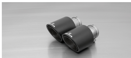
#70CS: Carbon tail pipes Ø 84 mm angled, Titanium internals