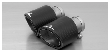
#70CSS: Carbon-tail pipes Ø 102 mm angled/angled, Titanium internals