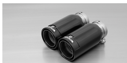
#98CB: tail pipes Ø 98 mm Street Race Black Chrome