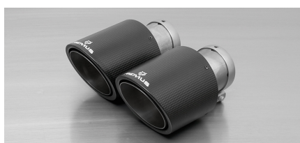
#70CS: Carbon tail pipes Ø 84 mm angled, Titanium internals