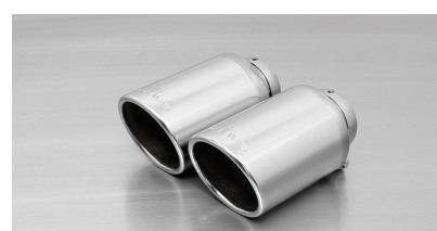
#70S: Endrohr Ø 102 mm schräg, verchromt