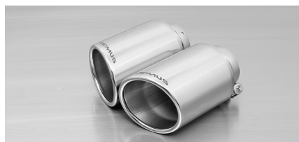
#70SS: tail pipes Ø 102 mm angled/angled, chromed