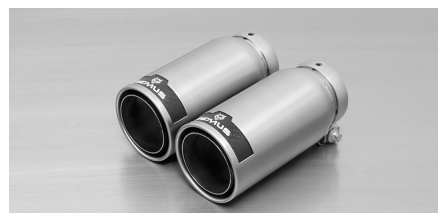
#98C: tail pipes Ø 98 mm Street Race, polished