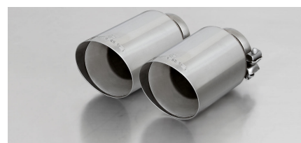
#70SG: tail pipes Ø 102 mm angled, straight cut, chromed