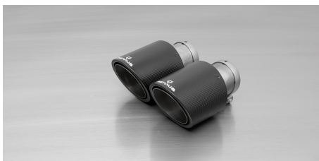
#70CS: Carbon-Endrohr Ø 102 mm schräg, Innenaufbau Titan