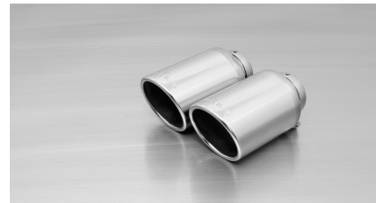
#70S: Endrohr Ø 102 mm schräg, verchromt