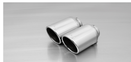
#70S: tail pipes Ø 102 mm angled, chromed