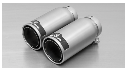
#83C: tail pipes Ø 84 mm Street Race, polished