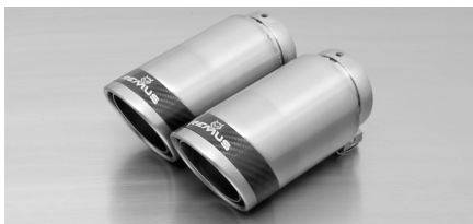
#83CS: tail pipe Ø 84 mm Carbon Race, angled, polished