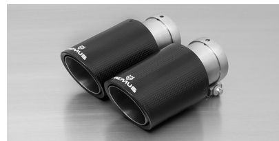
#83CTS: Carbon-tail pipes Ø 84 mm angled, Titanium internals