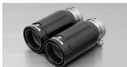
#83CB: tail pipes Ø 84 mm Street Race Black Chrome