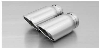
#55S: tail pipes Ø 84 mm angled, chromed