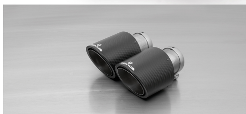
#70CSS: Carbon tail pipes Ø 102 mm angled/angled, Titanium internals