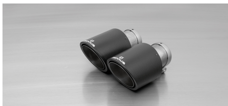
#70CS: Carbon tail pipes Ø 84 mm angled, Titanium internals