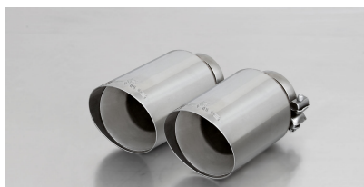
#70SG: tail pipes Ø 102 mm angled, straight cut, chromed