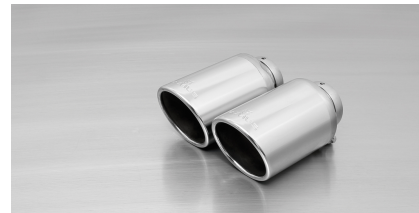
#70S: tail pipes Ø 102 mm angled, chromed