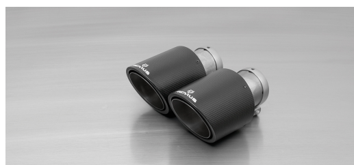
#70CS: Carbon-tail pipes Ø 102 mm angled, Titanium internals