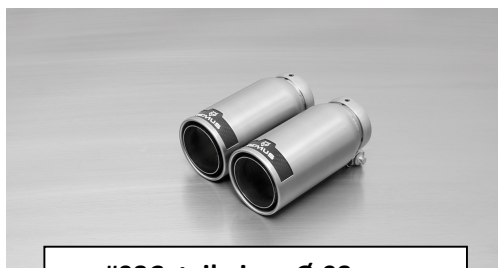
#98C: tail pipes Ø 98 mm Street Race, polished