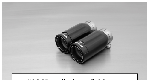
#98CB: tail pipes Ø 98 mm Street Race Black Chrome